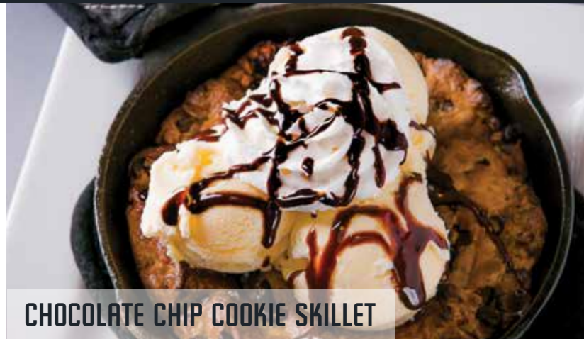
CHOCOLATE CHIP COOKIE SKILLET

Salted Caramel Chocolate Covered Pretzel S'mores Chocolate Strawberry