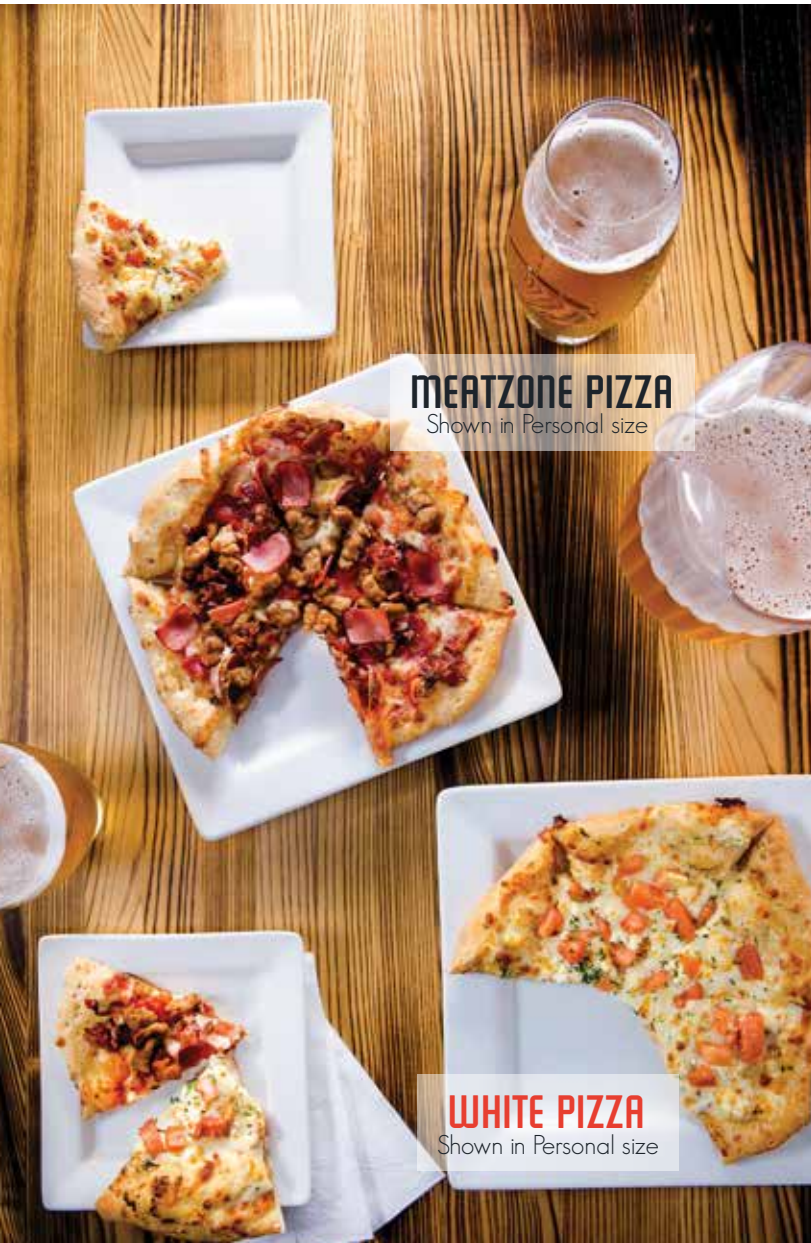
MEATZONE PIZZA Shown in Personal size

Crispy chicken tossed in buffalo sauce, layered on top of mozzarella and cheddar cheese and drizzled with our tangy ranch.