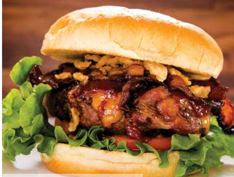
APPLEWOOD BACON BURGER

A fresh iceberg lettuce mix topped with grape tomatoes, cucumbers, onions, cheese, croutons and our crispy french fries, then topped with your choice of dressing. Add grilled chicken for $3.99 or steak for $5.99.